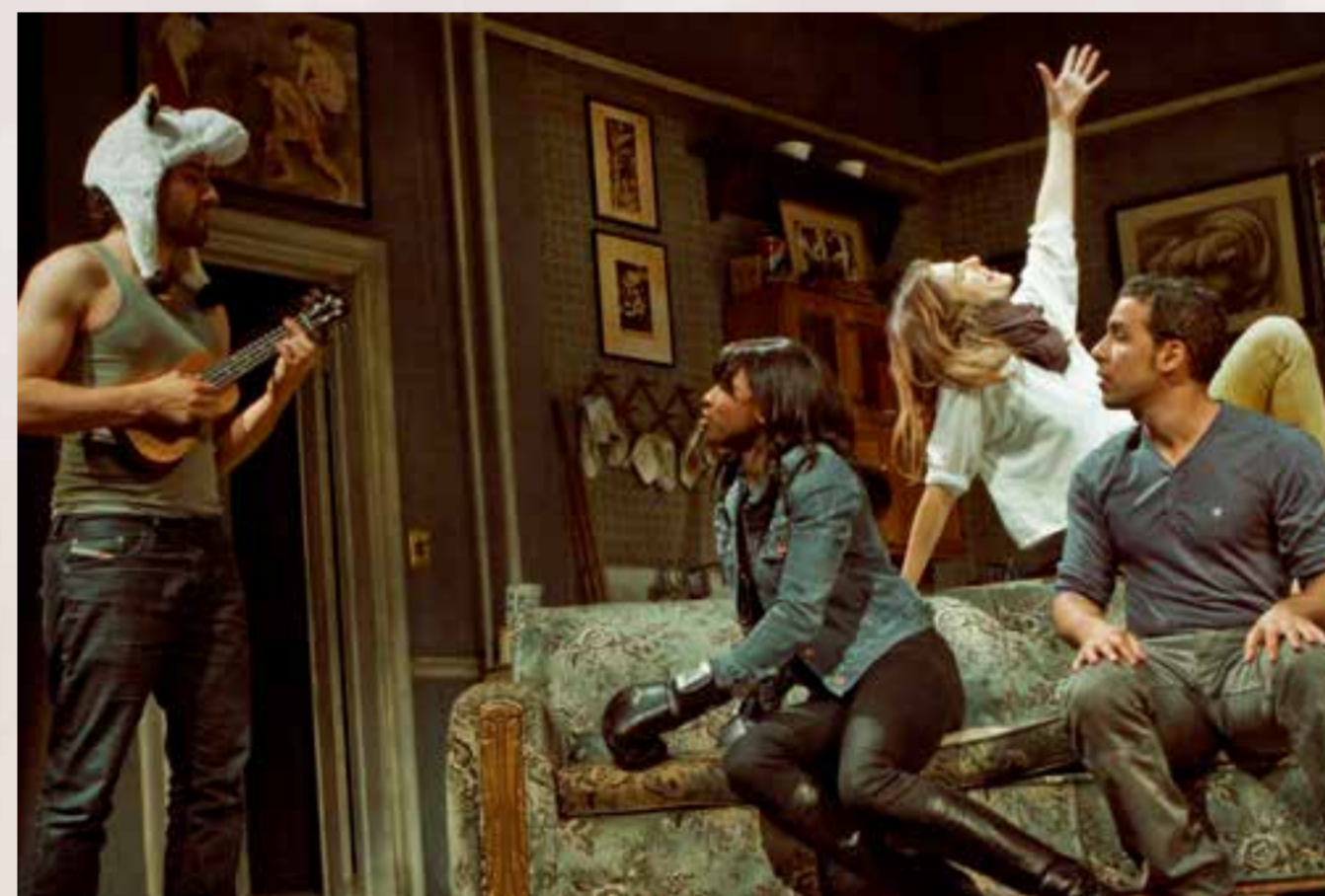
OSCAR ISAAC, RUTINA WESLEY, LAKE BELL and VICTOR RASUK in The 24 Hour Plays on Broadway 2011.