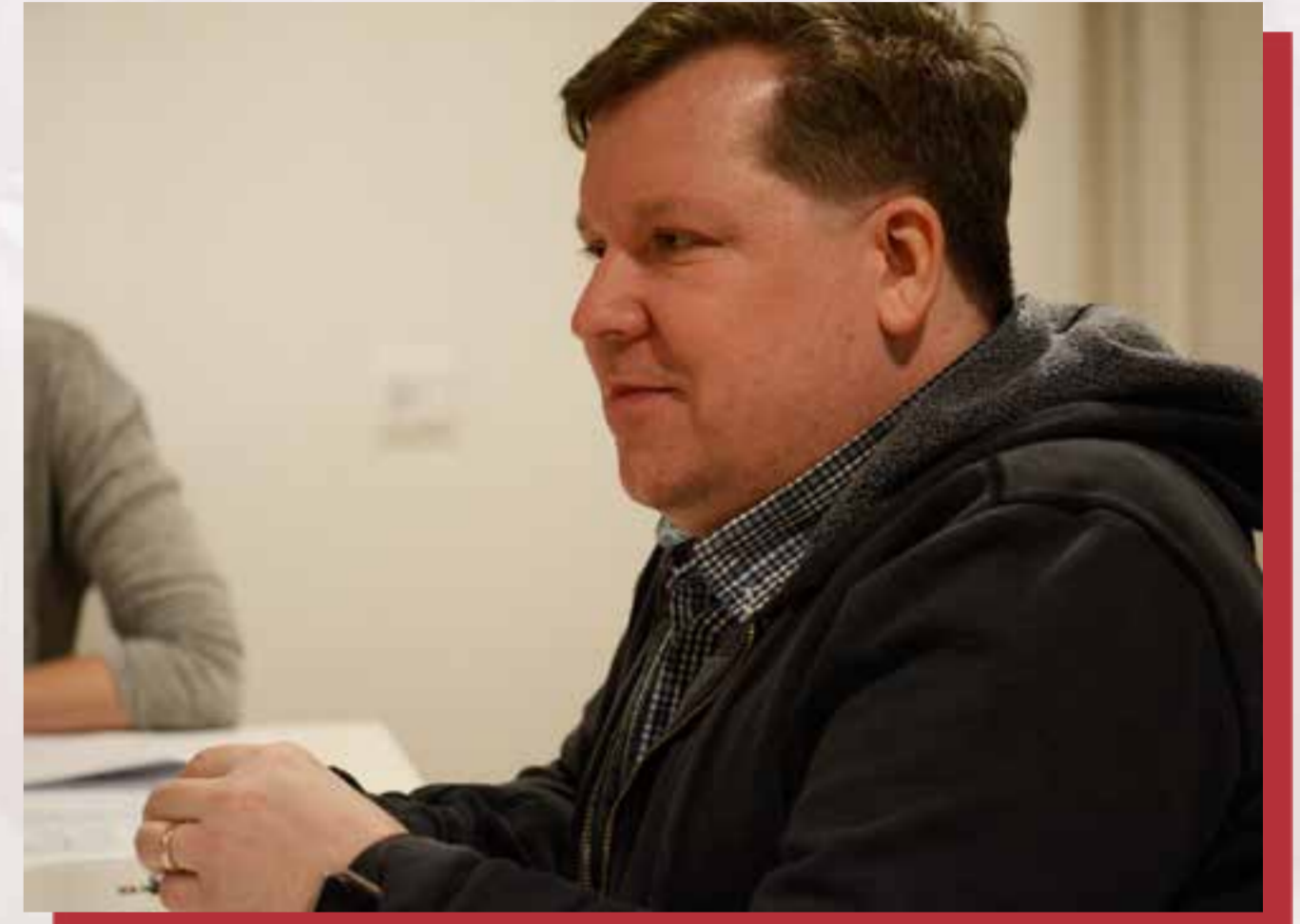
DAVID LINDSAY-ABAIRE fights to cast RACHEL DRATCH for another year in a row.