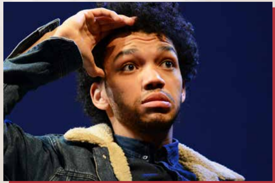
JUSTICE SMITH onstage at The 24 Hour Plays on Broadway 2016.

The 24 Hour Plays and Musicals have raised millions of dollars for charities around the globe. Each summer, The 24 Hour Plays: Nationals brings together theatermakers 25 and under for an intensive professional experience. Licensed affiliates have produced their own versions of The 24 Hour Plays® in regional theaters, colleges, high schools and just about everywhere you can find a curtain and a stage.