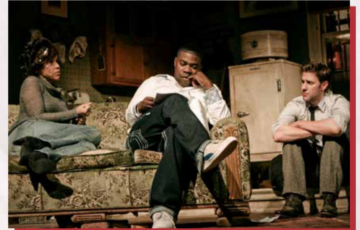
ROSIE PEREZ, TRACEY MORGAN and JOHN KRASINSKI in The 24 Hour Plays on Broadway 2011.

COMMUNITY BUILDING: The 24 Hour Plays would establish an annual tradition of a one-night-only theatrical experience that energizes and entertains participants and audiences alike.