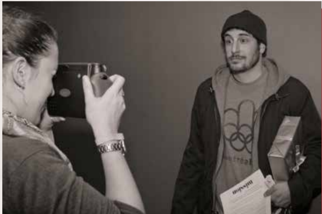
JASON BIGGS checks in to start rehearsal on Broadway.