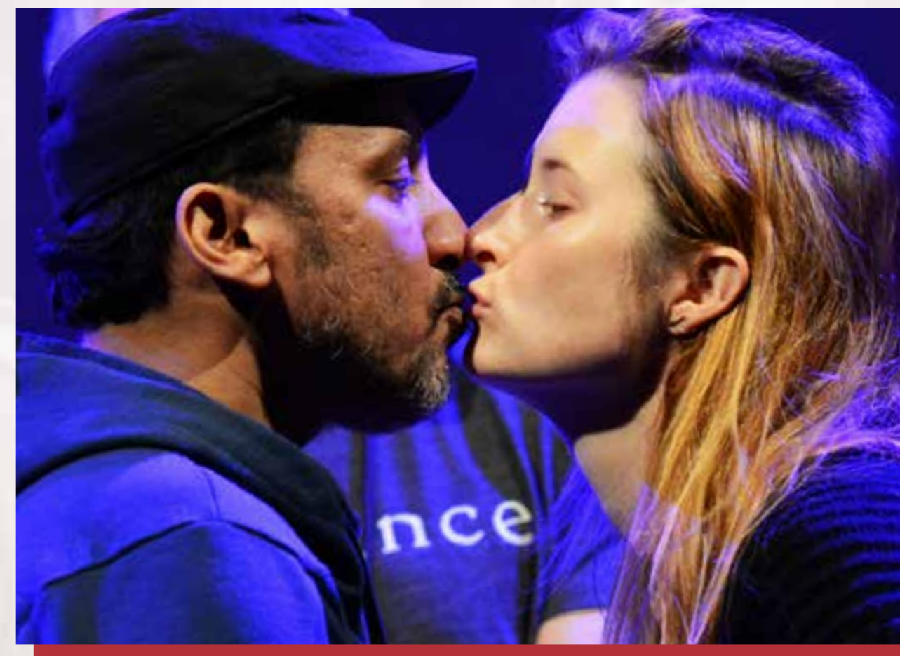
AASIF MANDVI and GRACE GUMMER in The 24 Hour Plays on Broadway in 2016.

The 24 Hour Plays: Mexico City — December 2018