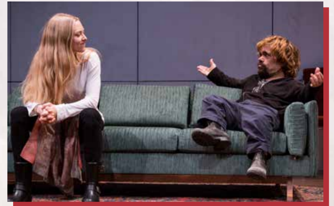
AMANDA SEYFRIED and PETER DINKLAGE onstage in The 24 Hour Plays on Broadway 2014.

COMPANY FEE: Percentage of gross revenue + expenses goes to The 24 Hour Plays.