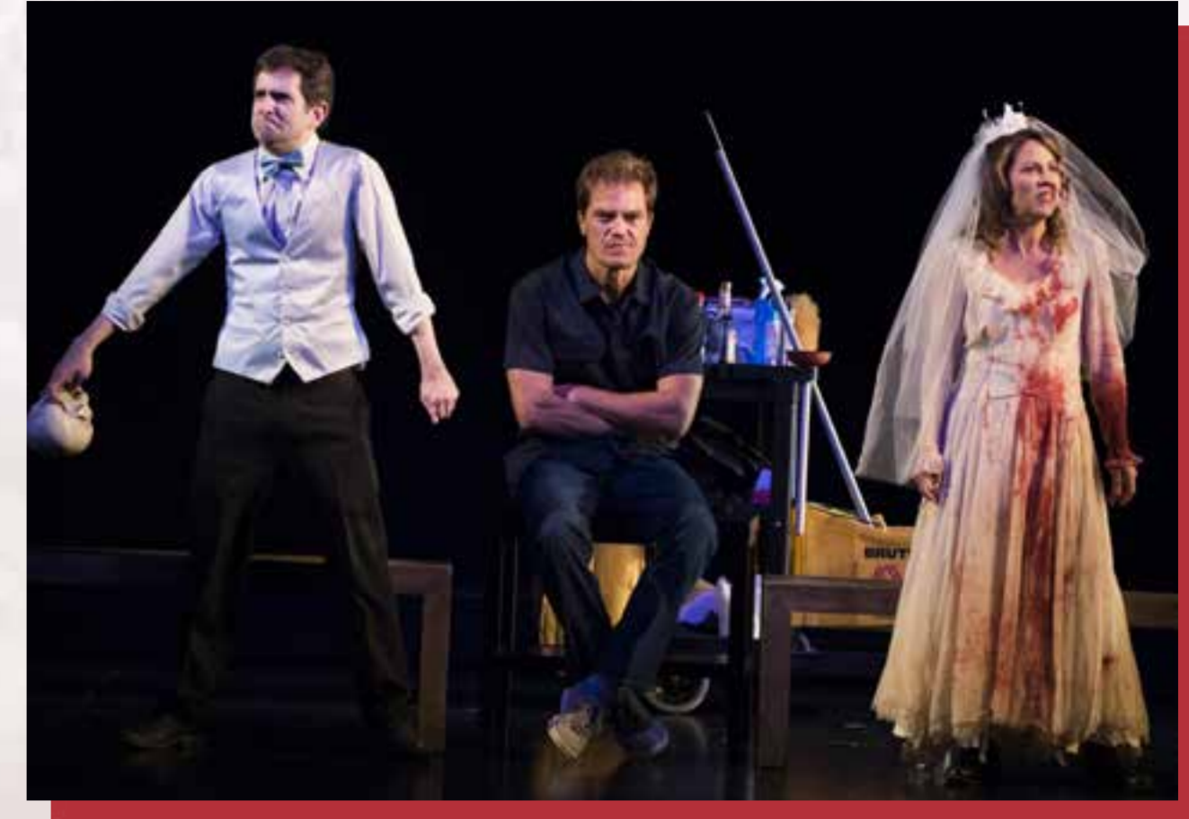
JONATHAN MARC SHERMAN, MICHAEL SHANNON and ELIZABETH RODRIGUEZ onstage in The 24 Hour Plays on Broadway 2017.