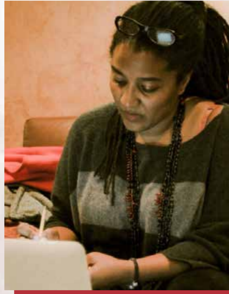
Pulitzer Prize winning playwright LYNN NOTTAGE uses the cast Polaroids to write her first draft.