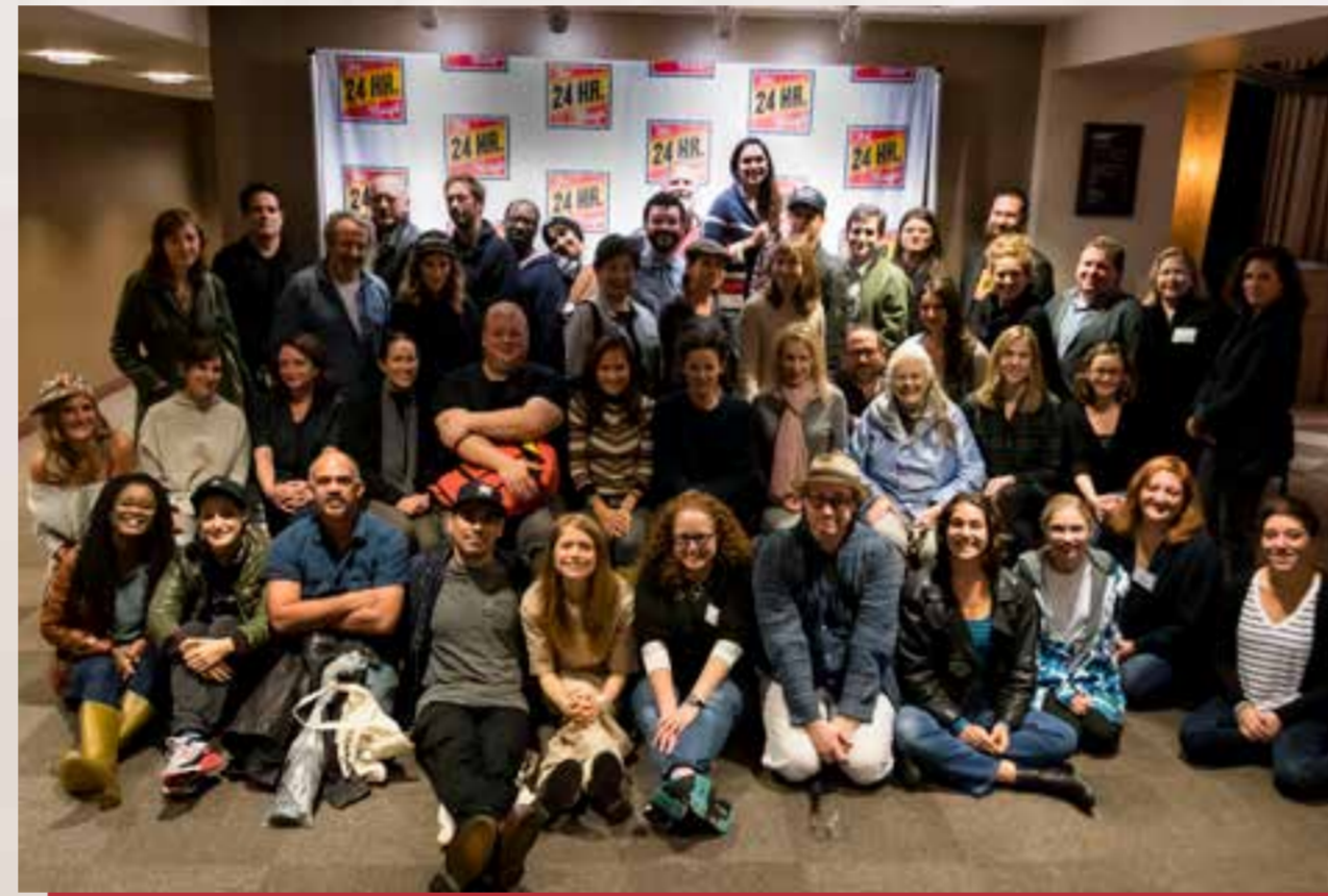
A quick group photo of the entire team before casting!